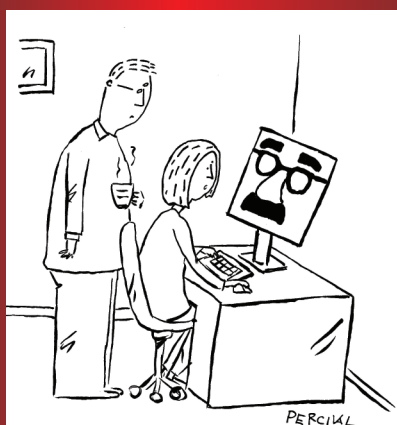
“The computer's acting funny.”