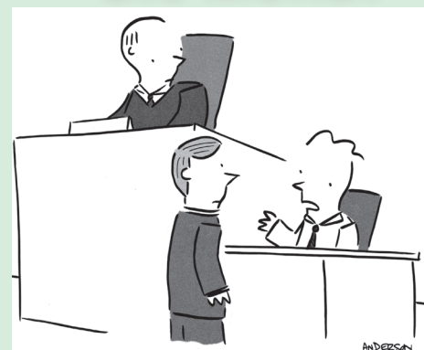
“I wouldn’t call it identity theft, I just self-identify as other people.”