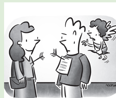
"If you could fill out the attached survey that would really help me out."